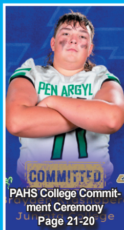
PAHS College Commit- ment Ceremony Page 21-20