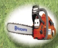
Husqvarna Chain saw

Our selection of off-road and lawn equipment includes Polaris ATVs, Ranger utility vehicles, and snowmobiles; Ski-Doo snowmobiles; Husqvarna power equipment and mowers, Can-Am ATVs, Spyders and UTV's; Scag Commercial Mowers; Cub Cadet lawnmowers and tractors; Yamaha generators and pressure washers.