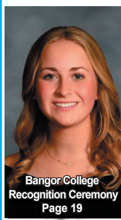
Bangor College Recognition Ceremony Page 19