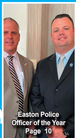
Easton Police Officer of the Year Page 10