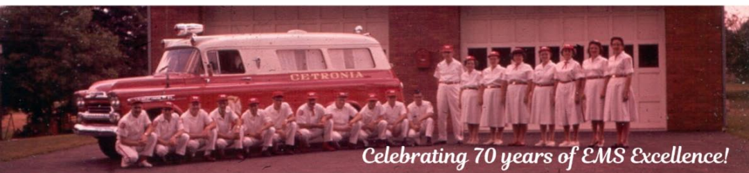
Celebrating 70 years of EMS Excellence!

Plus, enjoy a Kendra Scott pop-up shop, where 20% of every purchase will be donated back to Cetronia Ambulance Corps!