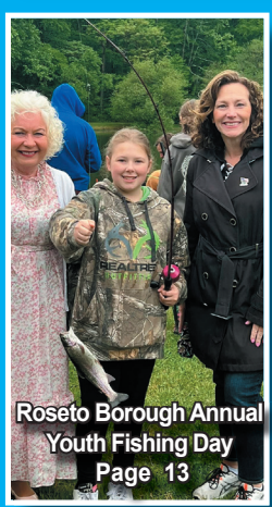
Roseto Borough Annual Youth Fishing Day Page 13