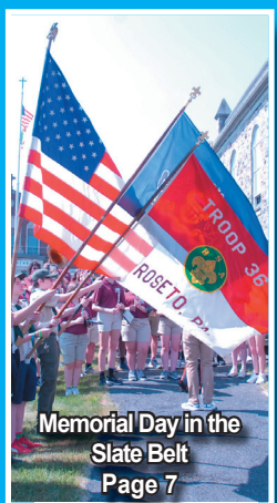
Memorial Day in the Slate Belt Page 7