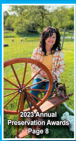
2023 Annual Preservation Awards Page 8