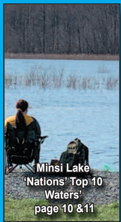
Minsi Lake 'Nations' Top 10 Waters' page 10 & 11