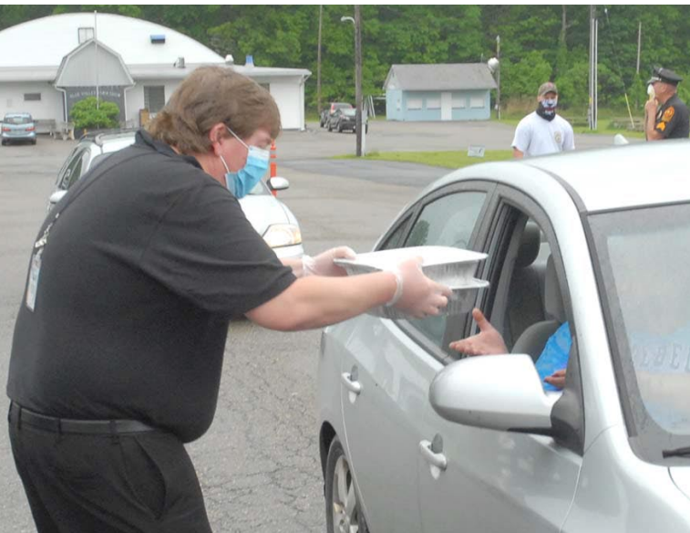
Left Lamont McClure County Executive hands out food at Blue Valley Farm Show Complex.