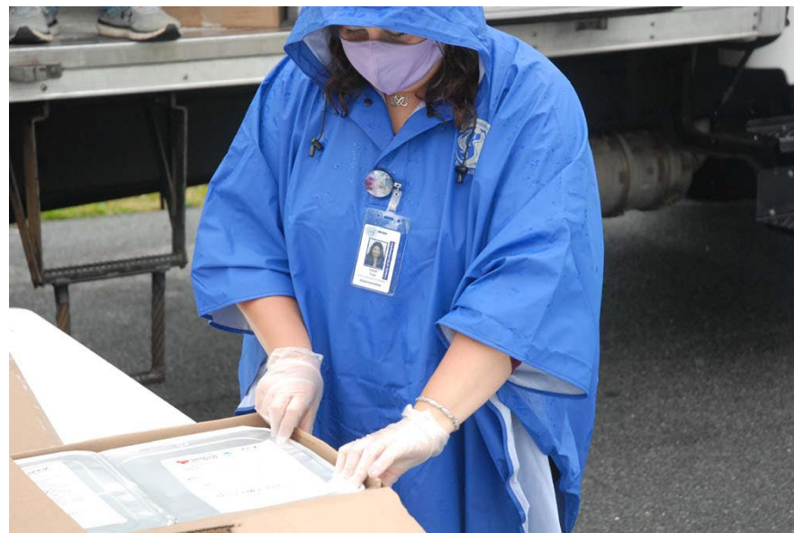
Bottom The 'County Crew' who spent hours feeding residents of Northampton County.