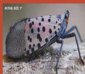
Adult (with wings closed) can be found July-December