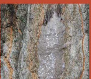
Egg mass (fresh) can be found October-December