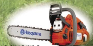
Husqvarna Chain saw

HELP WANTED Sales and Parts Apply Within