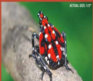
Nymph (late stage) can be found July-September