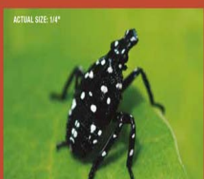
Nymph (early stage) can be found late April-July