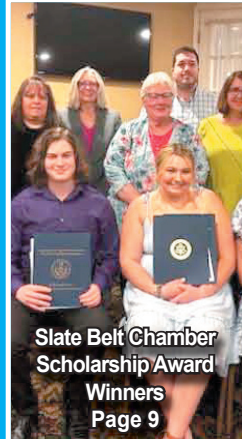
Slate Belt Chamber Scholarship Award Winners Page 9