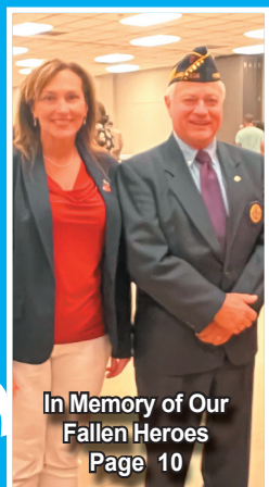
In Memory of Our Fallen Heroes Page 10