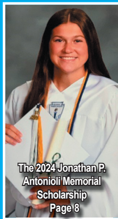
The 2024 Jonathan P. Antoniolli Memorial Scholarship Page 8