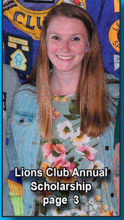
Lions Club Annual Scholarship page 3