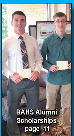
BAHS Alumni Scholarships page 11