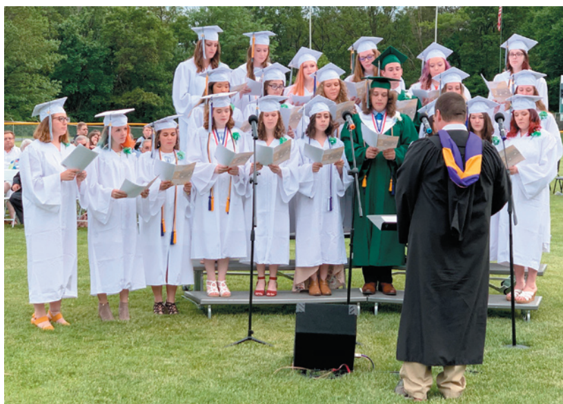
Senior Chorurs and Chamber singers sing "I Was Here"