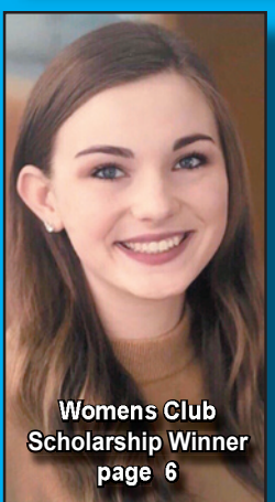
Womens Club Scholarship Winner page 6