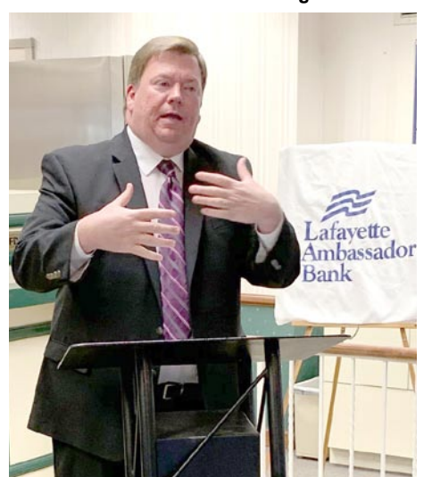
Northampton County Executive Lamont