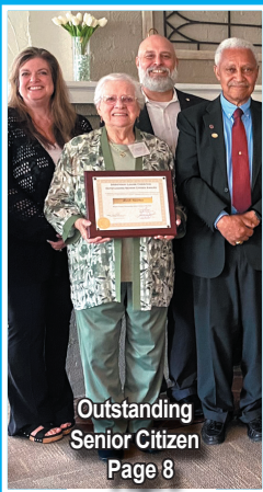
Outstanding Senior Citizen Page 8