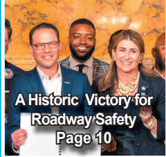
A Historic Victory for Roadway Safety Page 10