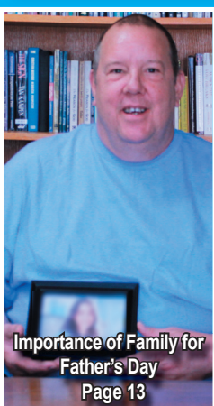
Importance of Family for Father's Day Page 13