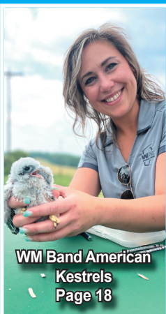
WM Band American Kestrels Page 18