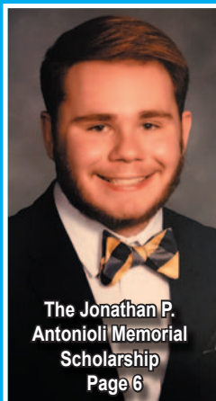
The Jonathan P. Antonioli Memorial Scholarship Page 6