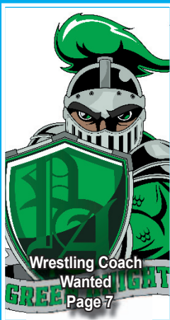
Wrestling Coach Wanted Page 7