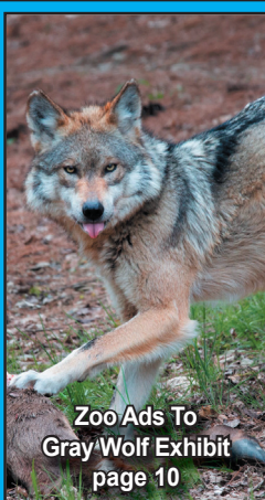
Zoo Ads To Gray Wolf Exhibit page 10