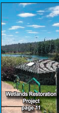
Wetlands Restoration Project page 11