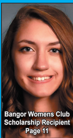
Bangor Womens Club Scholarship Recipient Page 11