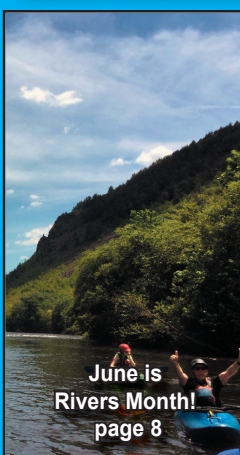
June is Rivers Month! page 8