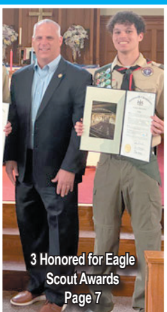
3 Honored for Eagle Scout Awards Page 7