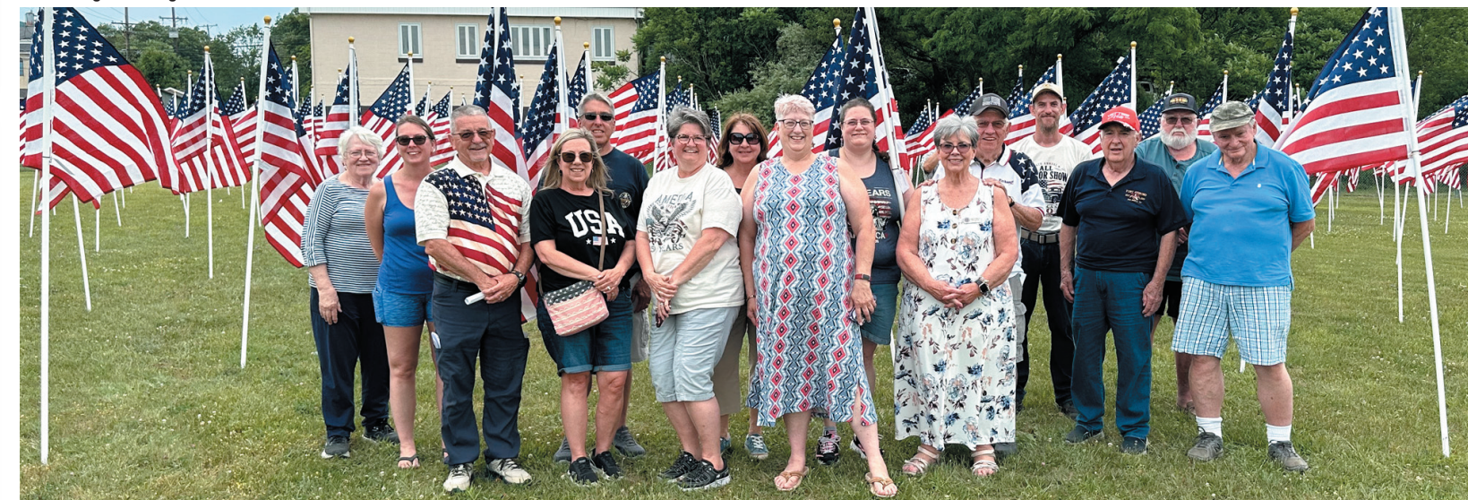
BANGOR EXCHANGE CLUB