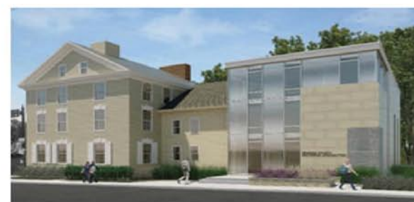
View of the Stroud Mansion's Ninth Street elevation

900 Main Street, Stroudsburg, PA 18360 ♦ 570-421-7703 ♦ admin@monroehistorical.org ♦ monroehistorical.ejoinme.org/cornerstonecampaign