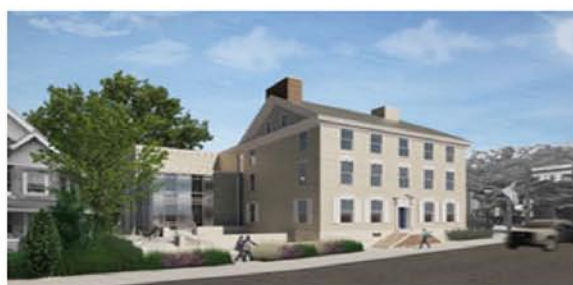
View of the Stroud Mansion's Main Street elevation

Begin a new century of service to promote, protect, and preserve Monroe County's historical legacy.