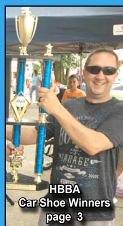
HBBA Car Shoe Winners page 3