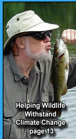
Helping Wildlife Withstand Climate Change page 13