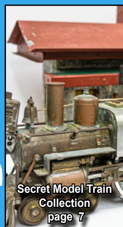
Secret Model Train Collection page 7