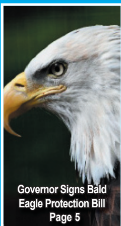
Governor Signs Bald Eagle Protection Bill Page 5