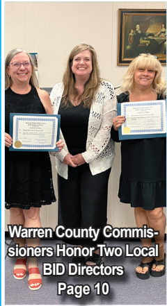
Warren County Commissioners Honor Two Local BID Directors Page 10