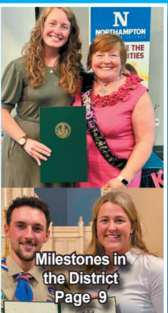
Milestones in the District Page 9