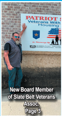
New Board Member of Slate Belt Veterans Assoc. Page 3