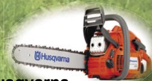
Husqvarna Chain saw

HELP WANTED Sales and Parts Apply Within