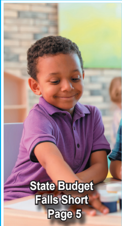
State Budget Falls Short Page 5