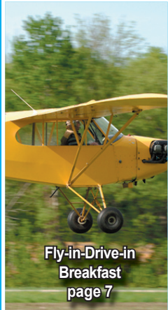
Fly-in-Drive-in Breakfast page 7