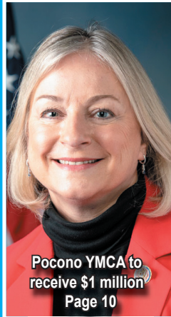
Pocono YMCA to receive $1 million Page 10