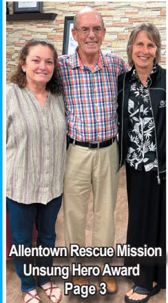
Allentown Rescue Mission Unsung Hero Award Page 3