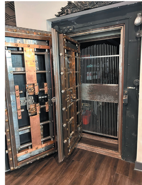
The 'vault' was saved, which became the name of her new business

to love so much more than just cutting and coloring. In 2024 I became certified in Hair Extensions. Along with being certified in Lash