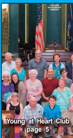
Young at Heart Club page 5