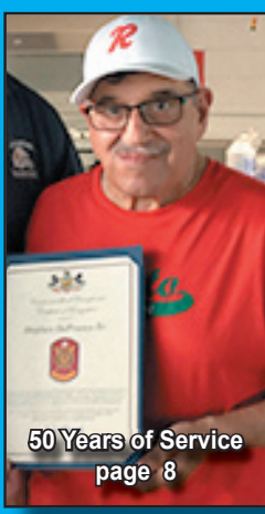
50 Years of Service page 8

VOL. 28 NO. 29 SERVING THE SLATE BELT, SOUTHERN POCONOS & NORTHERN N.J. WEEKLY IN PRINT AND DAILY ONLINE AT WWW.BLUEVALLEYTIMES.COM AND FACEBOOK JULY 16, 2019