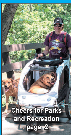
Cheers for Parks and Recreation page 2