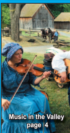
Music in the Valley page 4