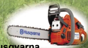
Husqvarna Chain saw