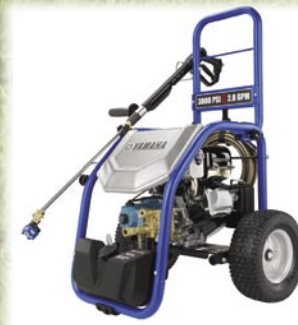
Yamaha pressure washers