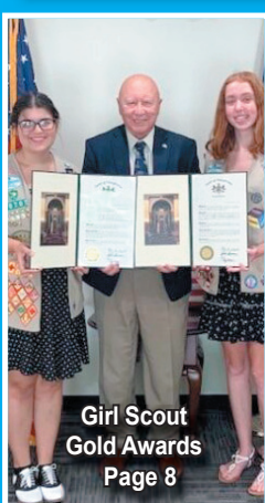
Girl Scout Gold Awards Page 8