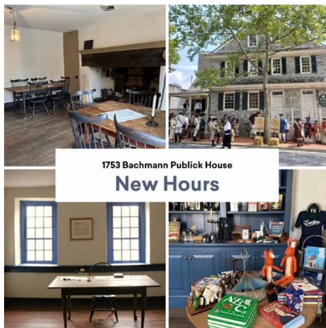
1753 Bachmann PubliK House New Hours

Thank you for your continued support, and we look forward to welcoming you soon.