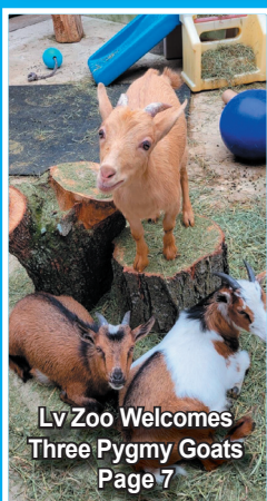
Lv Zoo Welcomes Three Pygmy Goats Page 7