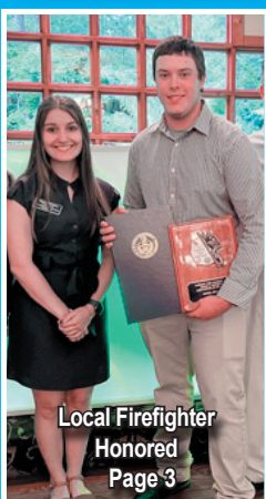
Local Firefighter Honored Page 3