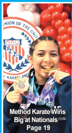
Method Karate Wins Big at Nationals Page 19