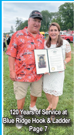
120 Years of Service at Blue Ridge Hook & Ladder Page 7