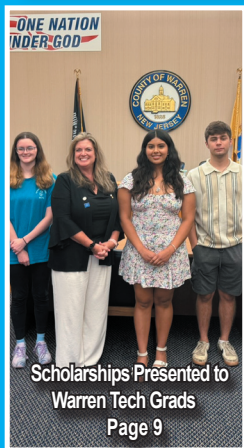
Scholarships Presented to Warren Tech Grads Page 9