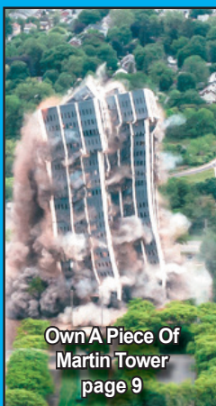
Own A Piece Of Martin Tower page 9