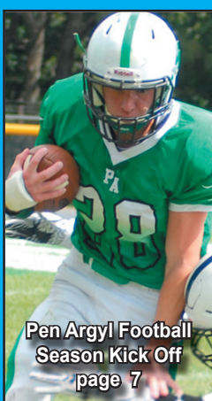
Pen Argyl Football Season Kick Off page 7