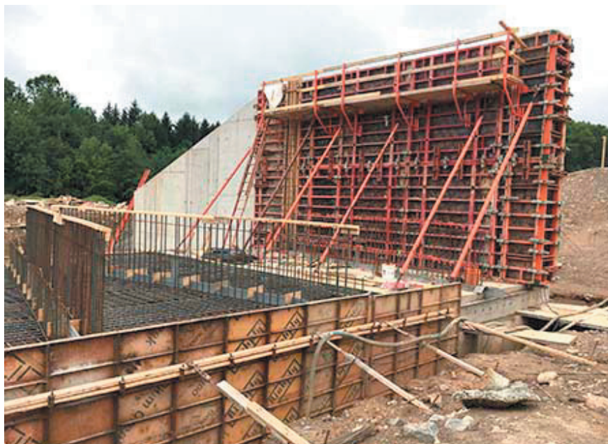
Constrution of the new spillway