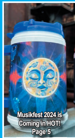
Musikfest 2024 is Coming in HOT! Page 5