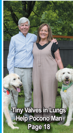
Tiny Valves in Lungs Help Pocono Man Page 18