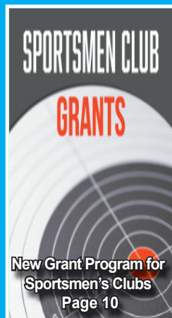
New Grant Program for Sportsmen's Clubs Page 10