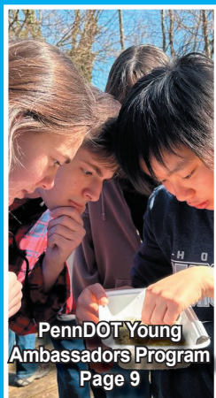
PennDOT Young Ambassadors Program Page 9