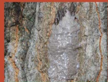
Egg mass (fresh) can be found October–December