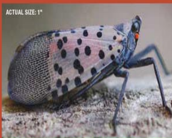
Actual size: 1" Adult (with wings closed) can be found July–December