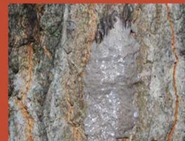
Egg mass (fresh) can be found October–December