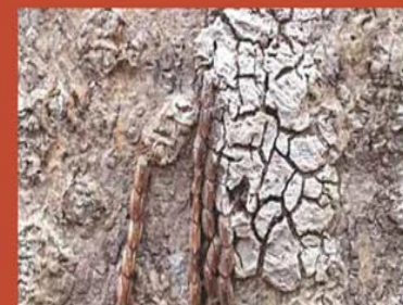
Egg mass (older) can be found January–June