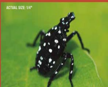
Actual size: 1/4" Nymph (early stage) can be found late April–July