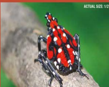
Actual size: 1/2" Nymph (late stage) can be found July–September