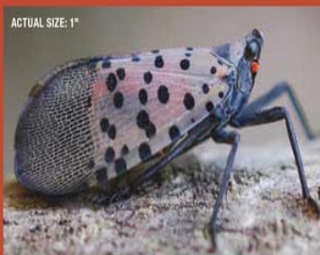
Actual size: 1" Adult (with wings closed) can be found July–December