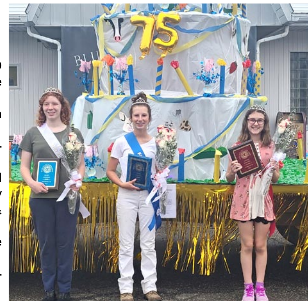
Continued on page 7 The Queen and her court winners stand in front of a 7' three tier cake saying 75th on it for the 75th anniversary

All ages participated in the Coal County Express train rides, Bingo & Nightly Entertainment (Bangor High School Marching Band was one of them).