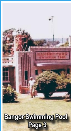
Bangor Swimming Pool Page 3