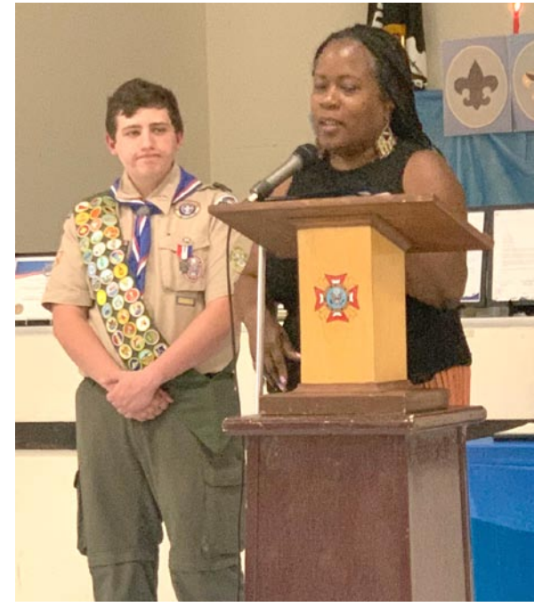
Selina from Congresswoman Susan Wild Office