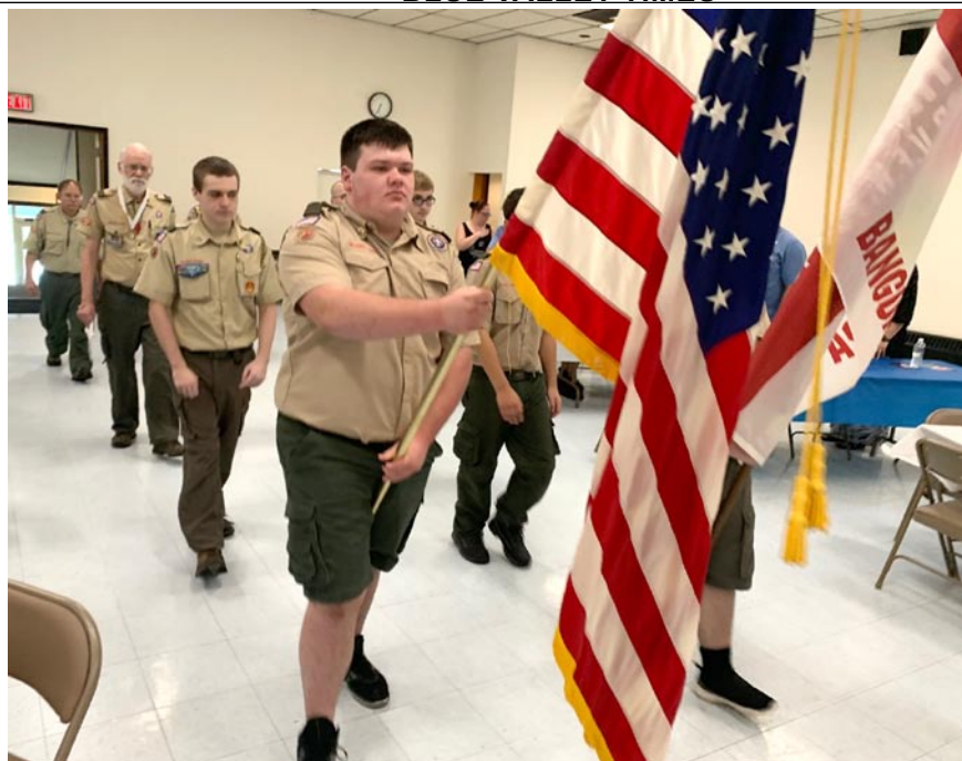
Troop 38 Presentation of the Colors