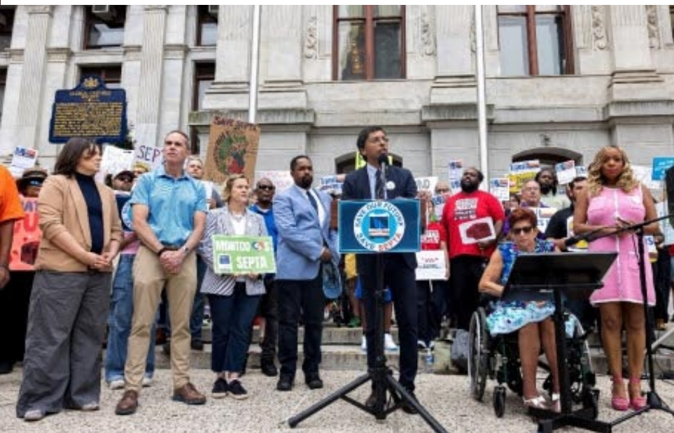
State Sen. Nikil Saval, D-Philadelphia, speaks at a rally alongside Pennsylvanians advocating for public transit funding. Investments in transit infrastructure contribute more than $1.5 billion annually to Pennsylvania's economy, supporting nearly 9,500 jobs and more than $500 million in wages.