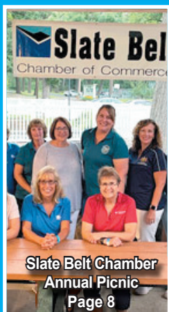
Slate Belt Chamber Annual Picnic Page 8