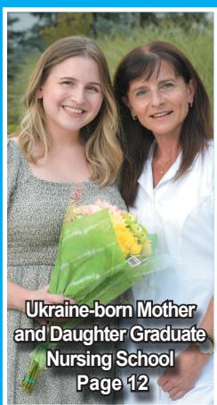
Ukraine-born Mother and Daughter Graduate Nursing School Page 12