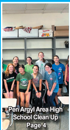
Pen Argyl Area High School Clean Up Page 4