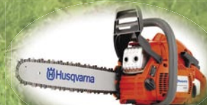
Husqvarna Chain saw