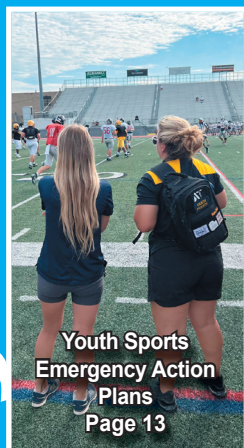
Youth Sports Emergency Action Plans Page 13