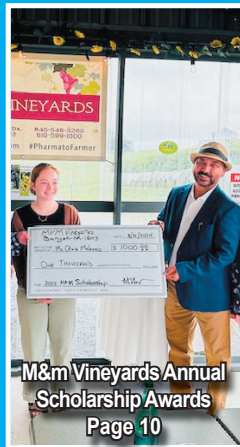
M&M Vineyards Annual Scholarship Awards Page 10