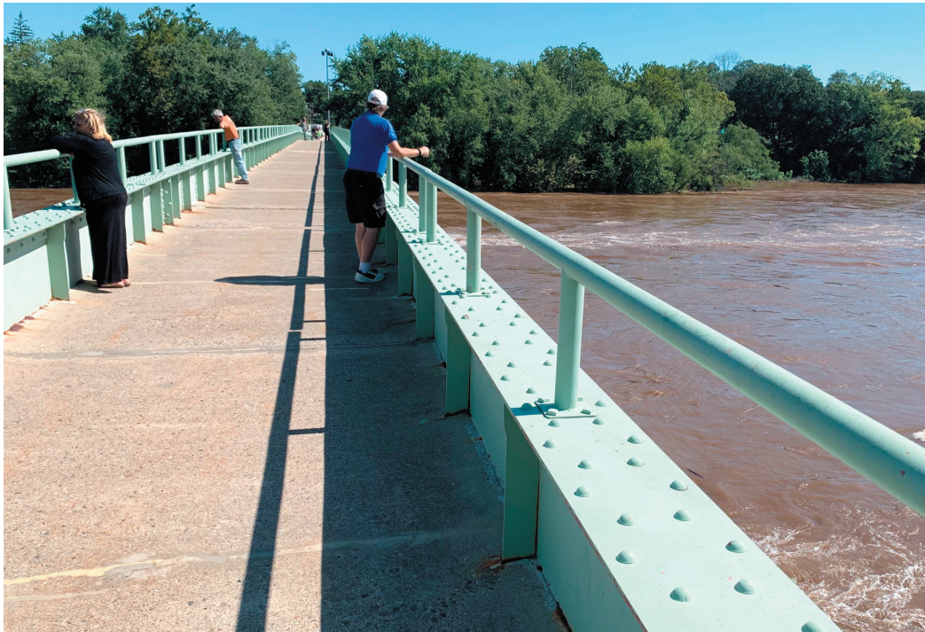
Flood sightseers on the pedestrian bridge in Portland that spans the Del. River from Pa. to N.J.

The new dam at Minsi Lake 'worked excelent' according to a dam watcher from Pa. Fish & Boat. The dam stayed in the 'White Zone' through out the entire event. There is a water level painted