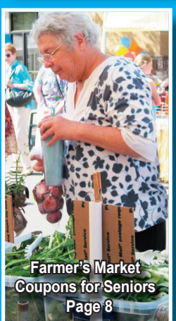
Farmer's Market Coupons for Seniors Page 8