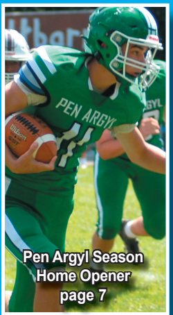
Pen Argyl Season Home Opener page 7

VOL. 29 NO. 36 SERVING THE SLATE BELT, SOUTHERN POCONOS & NORTHERN N.J. DAILY ONLINE AT WWW.BLUEVALLEYTIMES.COM AND FACEBOOK SEPTEMBER 7, 2021