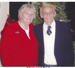
Mom and Dad