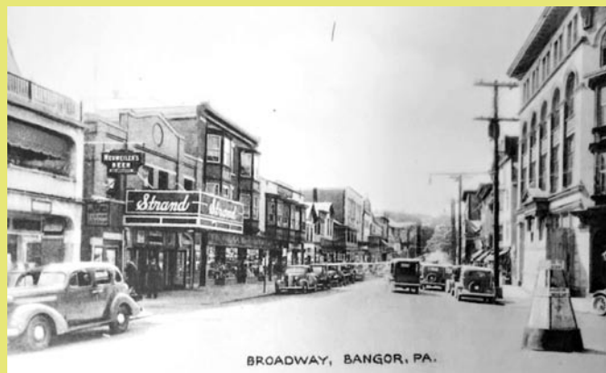
BROADWAY, BANGOR, PA.

AN OLD PHOTO BUT A CLEAR PHOTO HIGHLIGHTED BY THE TRAFFIC "DUMMY" IN THE LOWER RIGHT CORNER.