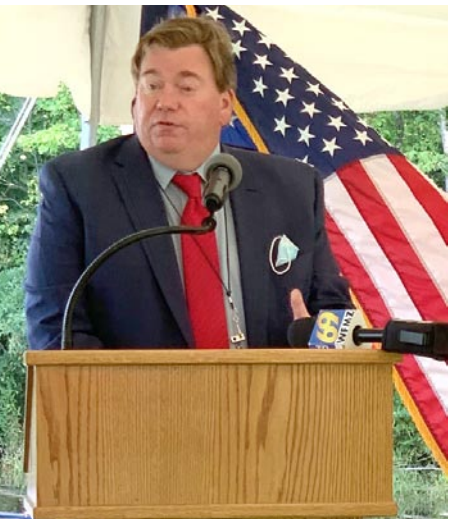
County Executive Lamont McClure