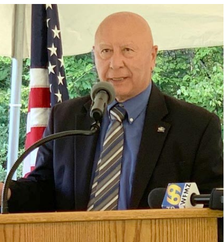
Senator Mario Scavella