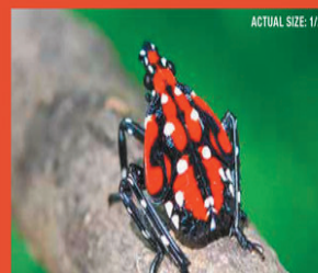
Nymph (late stage) can be found July–September