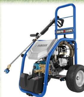
Yamaha pressure washers