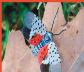
Adult (with wings open) can be found July–December