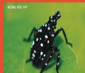
Nymph (early stage) can be found late April–July