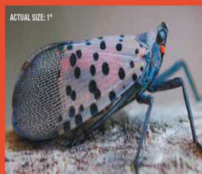
Adult (with wings closed) can be found July–December