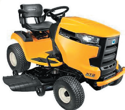
Cub Cadet XT Enduro Series