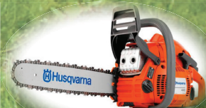
Husqvarna Chain saw

HELP WANTED Sales and Parts Apply Within