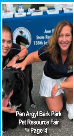
Pen Argyl Bark Park Pet Resource Fair Page 4