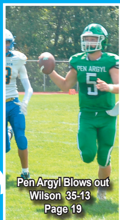
Pen Argyl Blows out Wilson 35-13 Page 19