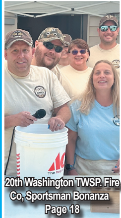
20th Washington TWSP Fire Co. Sportsman Bonanza Page 18