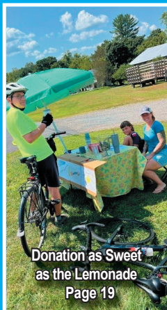
Donation as Sweet as the Lemonade Page 19