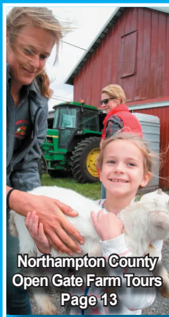
Northampton County Open Gate Farm Tours Page 13