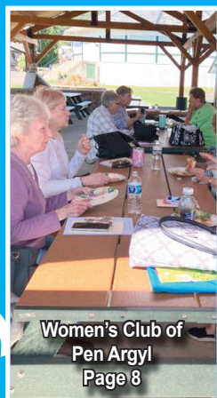
Women's Club of Pen Argyl Page 8