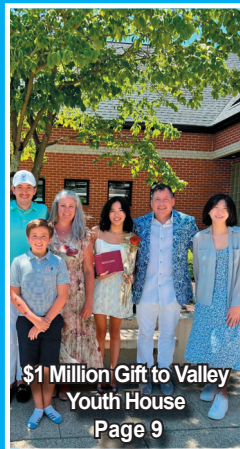
$1 Million Gift to Valley Youth House Page 9