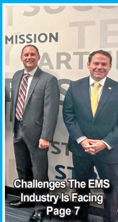
Challenges The EMS Industry Is Facing Page 7