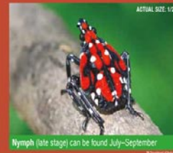
Nymph (late stage) can be found July-September