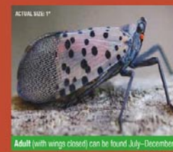
Adult (with wings closed) can be found July-December