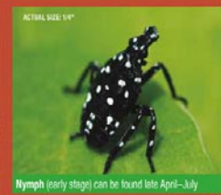
Nymph (early stage) can be found late April-July