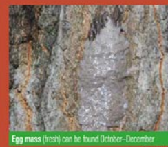
Egg mass (fresh) can be found October-December