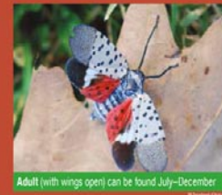
Adult (with wings open) can be found July-December