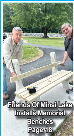
Friends Of Minsi Lake Installs Memorial Benches Page 18