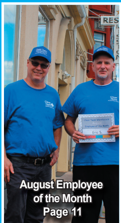
August Employee of the Month Page 11