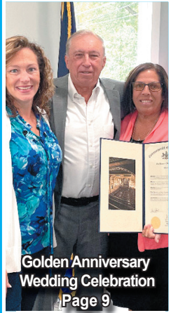
Golden Anniversary Wedding Celebration Page 9